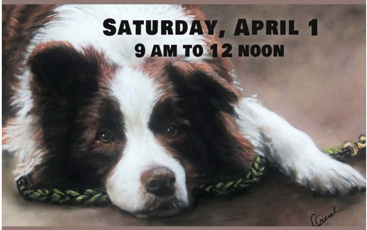
Sponsored by Thompson Valley Art League at Lincoln Gallery $75 TVAL members; $85 non-members; REGISTER at lincolngallery.com/workshops